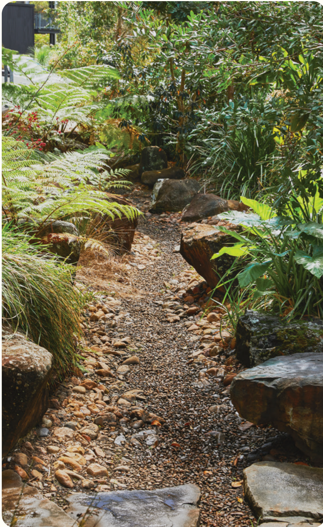
Mature landscaping in Habitat

Knowing the future of transport is electric, Easy Street has a number of dedicated charging stations for electric vehicles. Furthermore, we partnered with Popcar, the car share service, so people can get rid of their cars altogether, only paying for a vehicle when they need it.