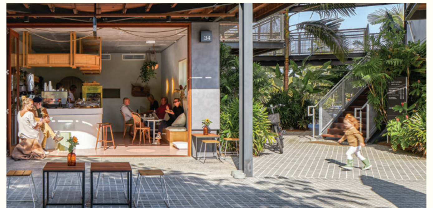
Shared outdoor meeting space