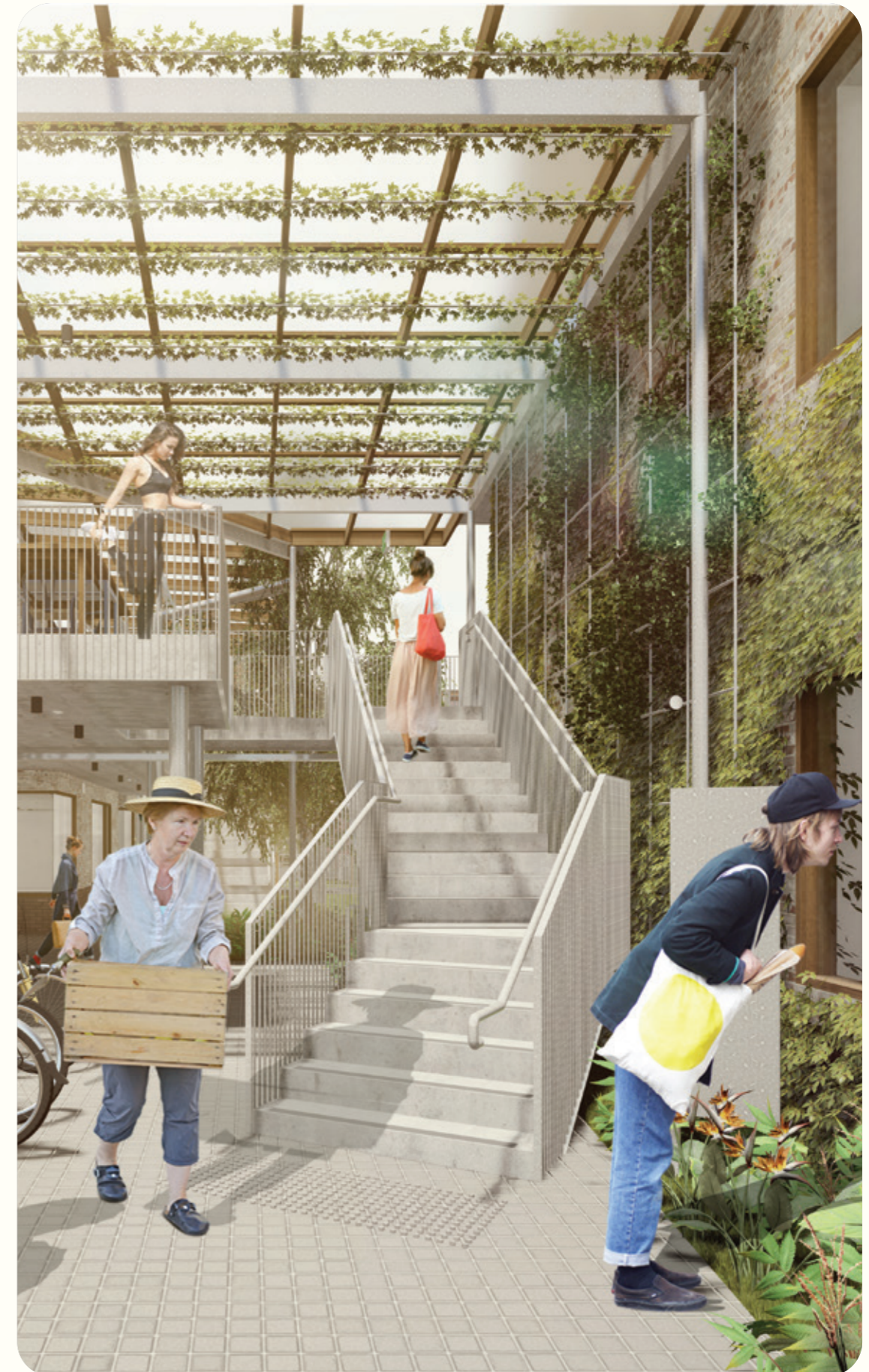
The light-filled main entry

Located in the heart of Habitat – a little oasis within one of the most beautiful places on Earth – Easy Street is a stroll from the beach (lunchtime surfs!) and 10-minute cycle to town.