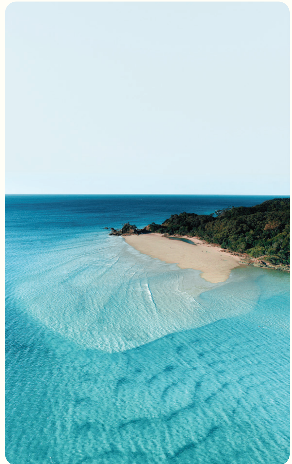
One of Byron's iconic beaches, The Pass

Getting here is easy with Ballina airport (with direct flights from Melbourne and Sydney) and the Gold Coast international airport 20 and 40 minutes away.