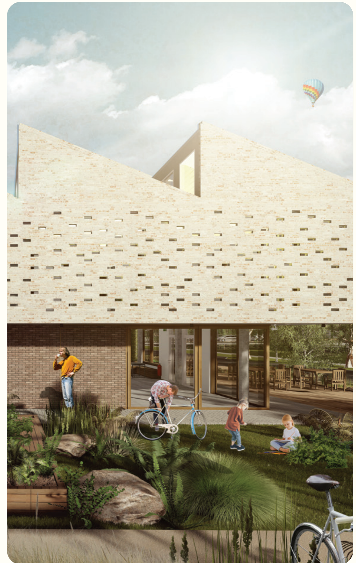
Cafe below, health studio above